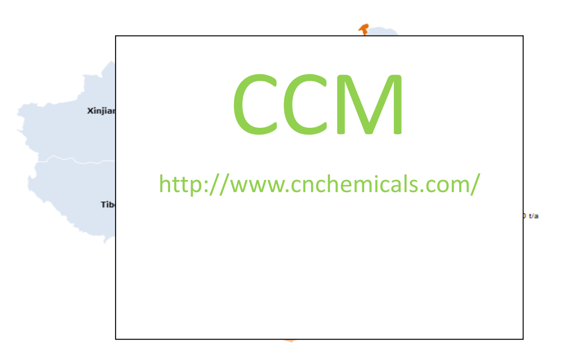
Figure 2.1.2-1 Distribution of major glycine producers by capacity of tech-grade glycine in China, 2020