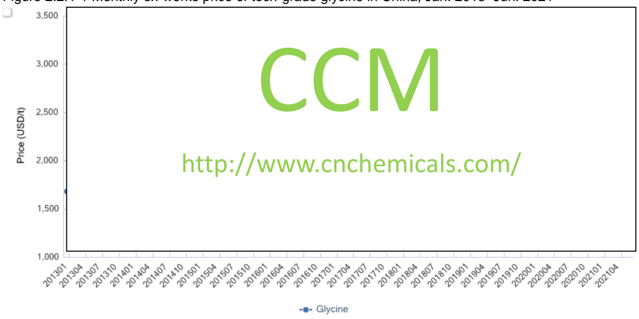
Figure 2.2.1-1 Monthly ex-works price of tech-grade glycine in China, Jan. 2013-Jun. 2021